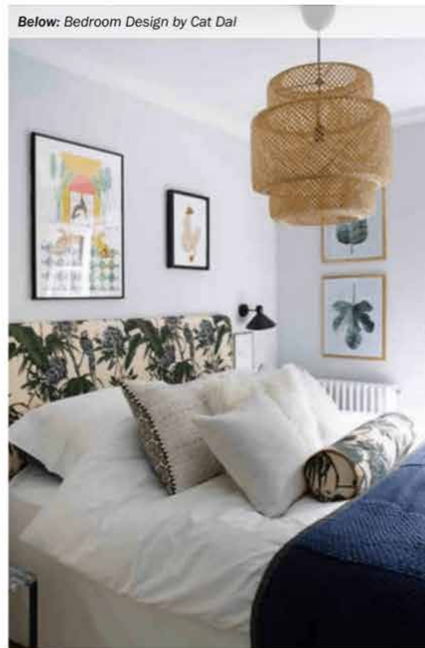
Below: Bedroom Design by Cat Dal

the walls is also a brilliant way to add depth to the walls, they become so inviting to touch, and add a layer of tactile luxury.