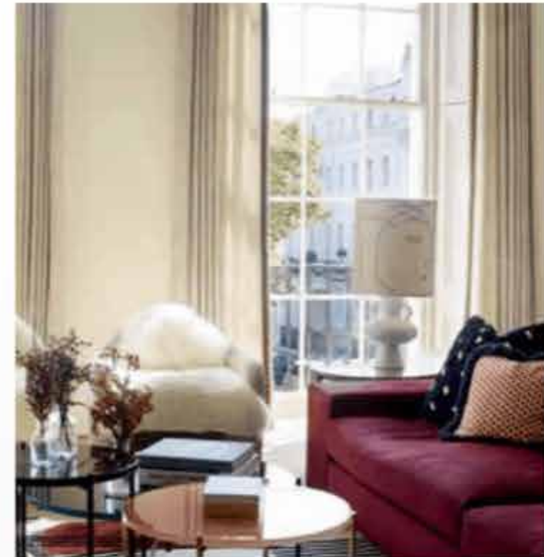
Designed by Cat Dal Interiors and completed in October 2021.

Located in a 190 year old Grade 1-listed building, this Brighton based property has been redesigned by Cat Dal Interiors. Taking cues from the landscape and the playful energy of the seaside town, a highly eclectic space has been filled with layers of texture, pattern and colour balanced with clean lines and a modern sensibility. Architectural details have been highlighted and reinstated throughout, mixing the client's heirloom pieces with vintage and modern classics, and incorporating new bespoke joinery wherever possible to provide ample storage. The result is a light, airy and sophisticated space filled with fun and whimsical moments.