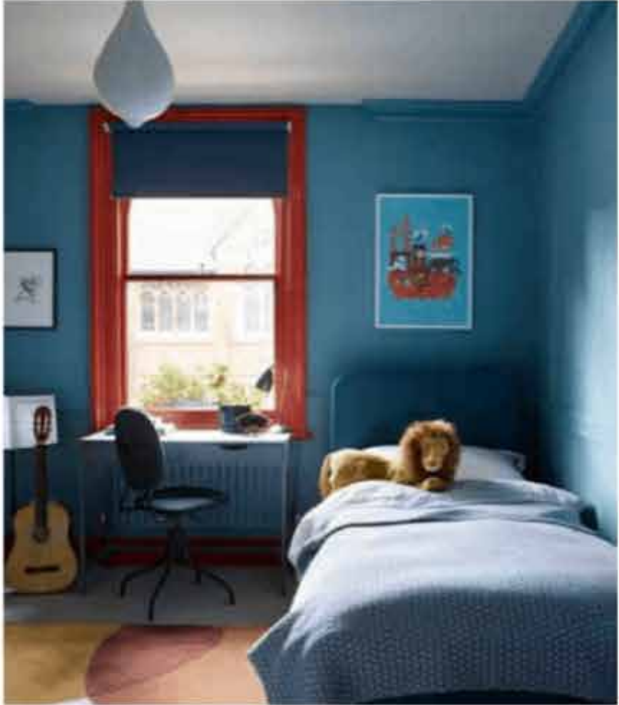
Above: Church Road Bedroom by Cat Dal

Usual requests include intelligent storage, spacious bedside tables, well designed wardrobes, and space to relax and encourage reading. When we start the wardrobe design this becomes a little more in-depth, where we assess their clothing volume and types, and then we can design accordingly, space for long dresses, formal wear, glass drawers separating ties or scarfs for example, there is a variety of ways we can organise and create a place of restoration away from the